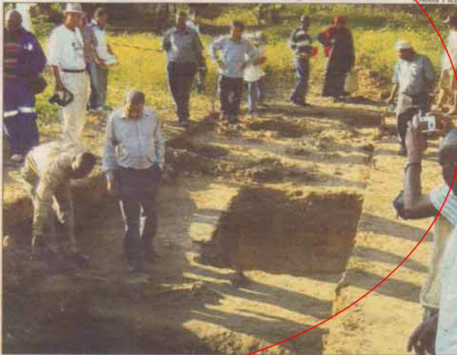
DISCOVERY: Chinese researchers and Kenyan archaeologists with National Museums of Kenya officials at the excavation site in Mamburi in September last year.